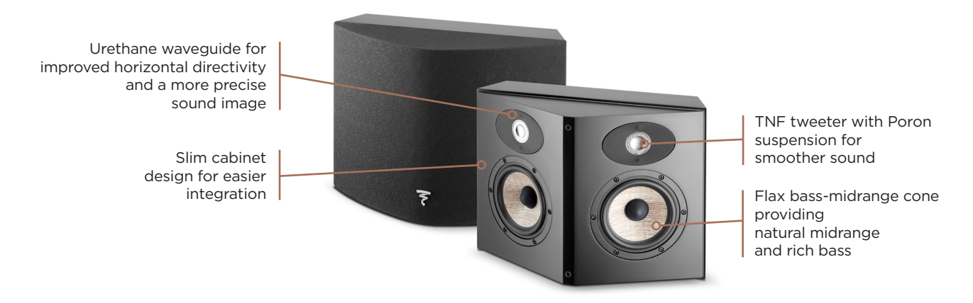
Aria SR900 Black Satin

Aria SR900 is a 2-way bipolar surround loudspeaker. Composed of two 5" (13cm) woofers with Flax sandwich cones, it provides very high-definition and natural sound. For the treble register, there are two aluminium/magnesium inverted dome tweeters with Poron suspension and a waveguide for a better control of directivity. Thanks to the Polyfix wall-mounting system provided, the compact SR900 loudspeaker is easy to integrate into your interior.